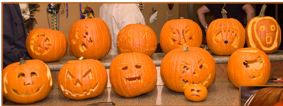
Pictures from the pumpkin carving contest at Bud's house — October 22, 2006

The annual HOT Bear Christmas Party . This year it's at a new location!