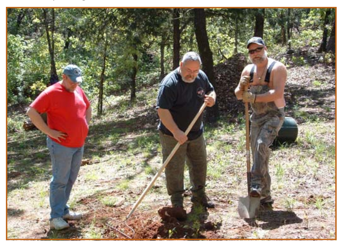
Some Hairy Potters — Getting Started at the Landsite