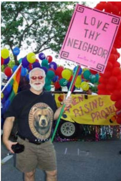
More pictures from the Austin Pride Parade June 1, 2002