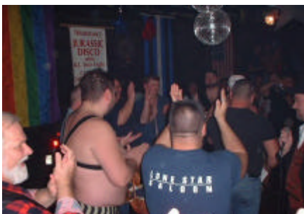
Contestants and HOT Bears