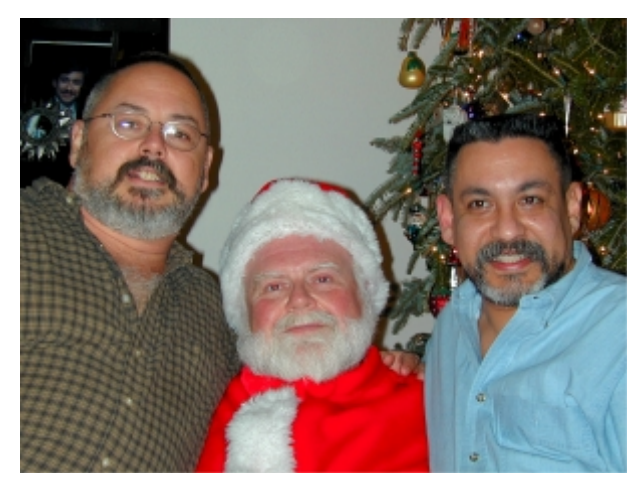
Our party hosts get a chance to sit on Santa's lap

Details for both events are still being worked out. Call TeleBear or check the web page for more info.