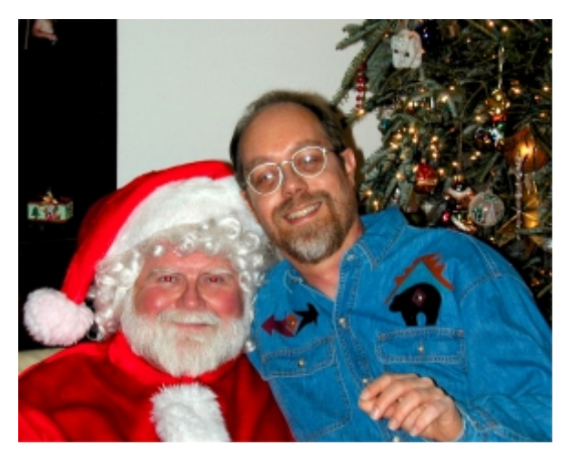
Our President asks Santa to bring lots of bears for Christmas