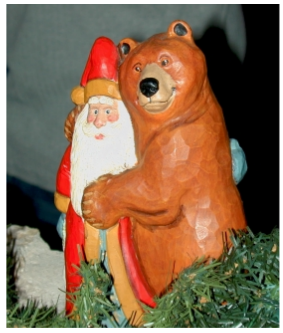
Bears really likes Santa